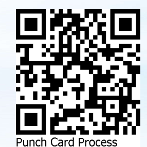
IBM Hursley Park Museum - 2020 https://slx-online.biz/hursley/pcprocess.asp Version 1.0