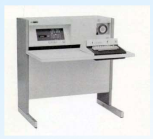
Magnetic tape 1968 IBM 050