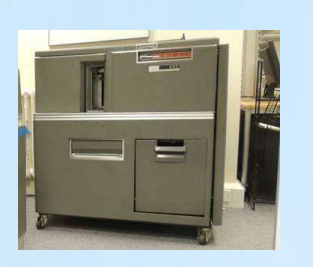
Wheels 1940s & 50s